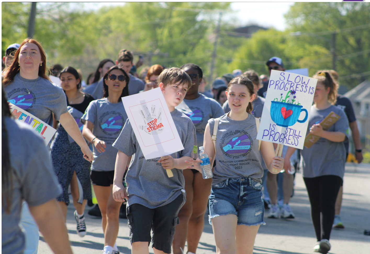
Students, staff and community members walk Friday, April 28, 2023, along the Sixth Street bridge during the second annual Burlington Community Walk to Fight Suicide, which began at Bracewell Stadium and ended at the Port of Burlington.