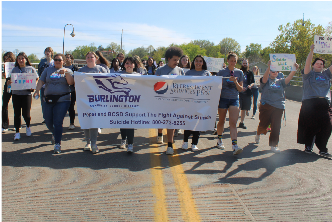
Members of Burlington High School's Bring Change to Mind Club lead the way Friday, April 28, 2023, along the Sixth Street bridge during the second annual Burlington Community Walk to Fight Suicide.