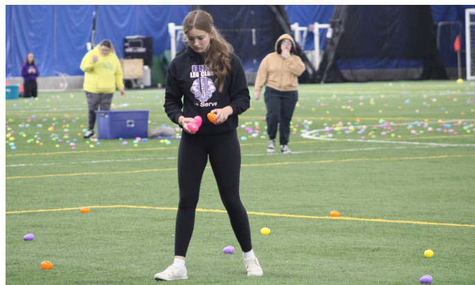
Burlington High School Leo Club members distribute Easter eggs Sunday, April 23, 2023, ahead of the Joshua's Eyes Easter Egg Hunt at the FunCity Turf.