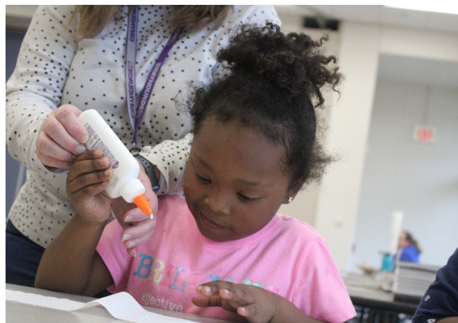
Kindergartners make seed strips Wednesday, April 19, 2023, at Grimes Elementary School.