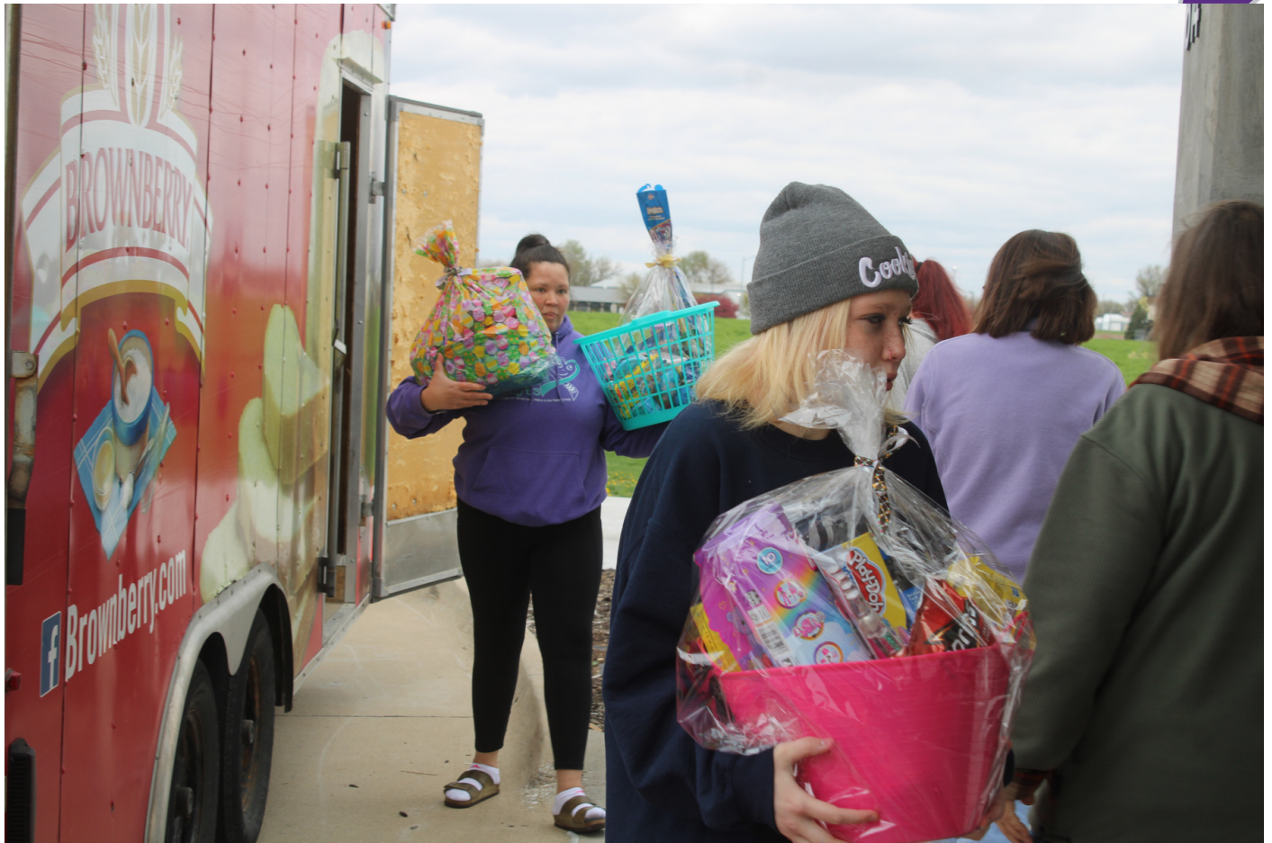
Burlington High School Leo Club members transport Easter baskets from a truck to the FunCity Turf Sunday, April 23, 2023, ahead of the Through Joshua's Eyes Easter Egg Hunt.