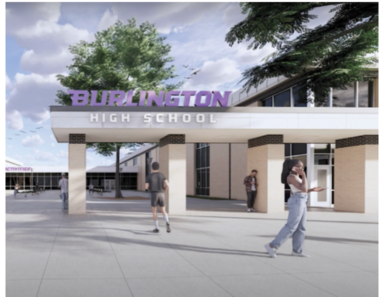
A rendering shows the future canopy and signage that will mark the new office entrance to Burlington High School.

The current weight room will be used to house the new HVAC system, and students already have begun helping to clear the area for work to begin.