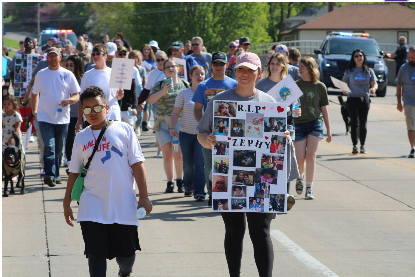
Students, staff and community members walk Friday, April 28, 2023, along the Sixth Street bridge during the second annual Burlington Community Walk to Fight Suicide, which began at Bracewell Stadium and ended at the Port of Burlington.