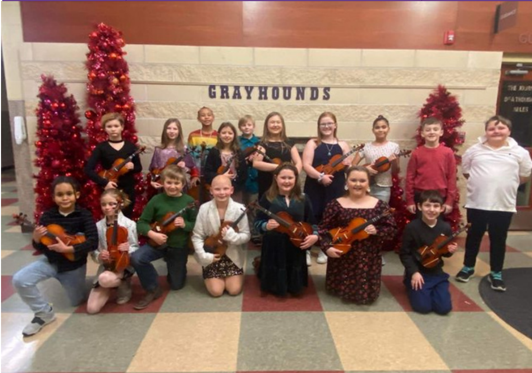
4th Grade Orchestra students pose for a picture at their concert on December 20th. We hope our families had a wonderful holiday break and look forward to welcoming students back on January 3, 2023.