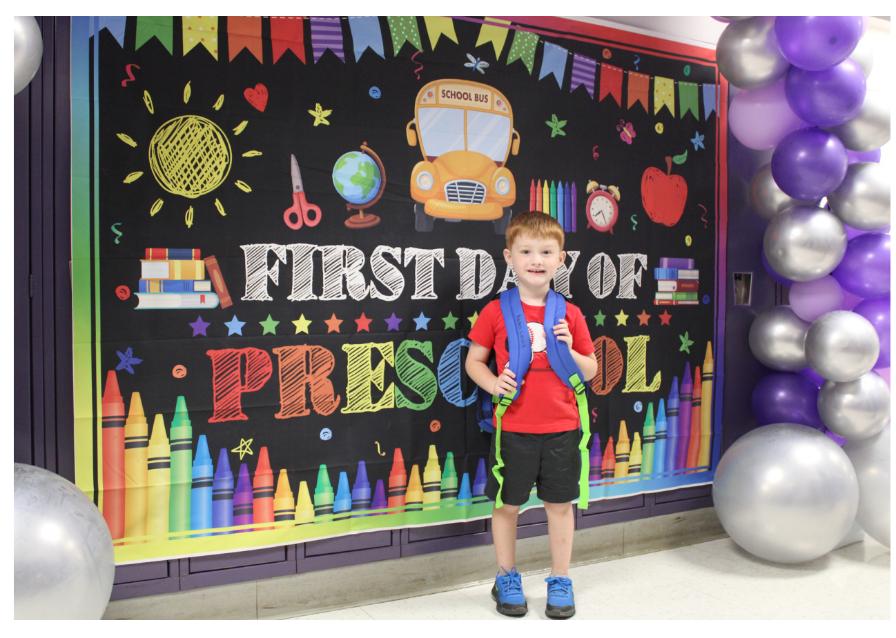
It's official! The Grayhounds are back to school. Students and staff have returned for another year of learning, activities, sports & more!