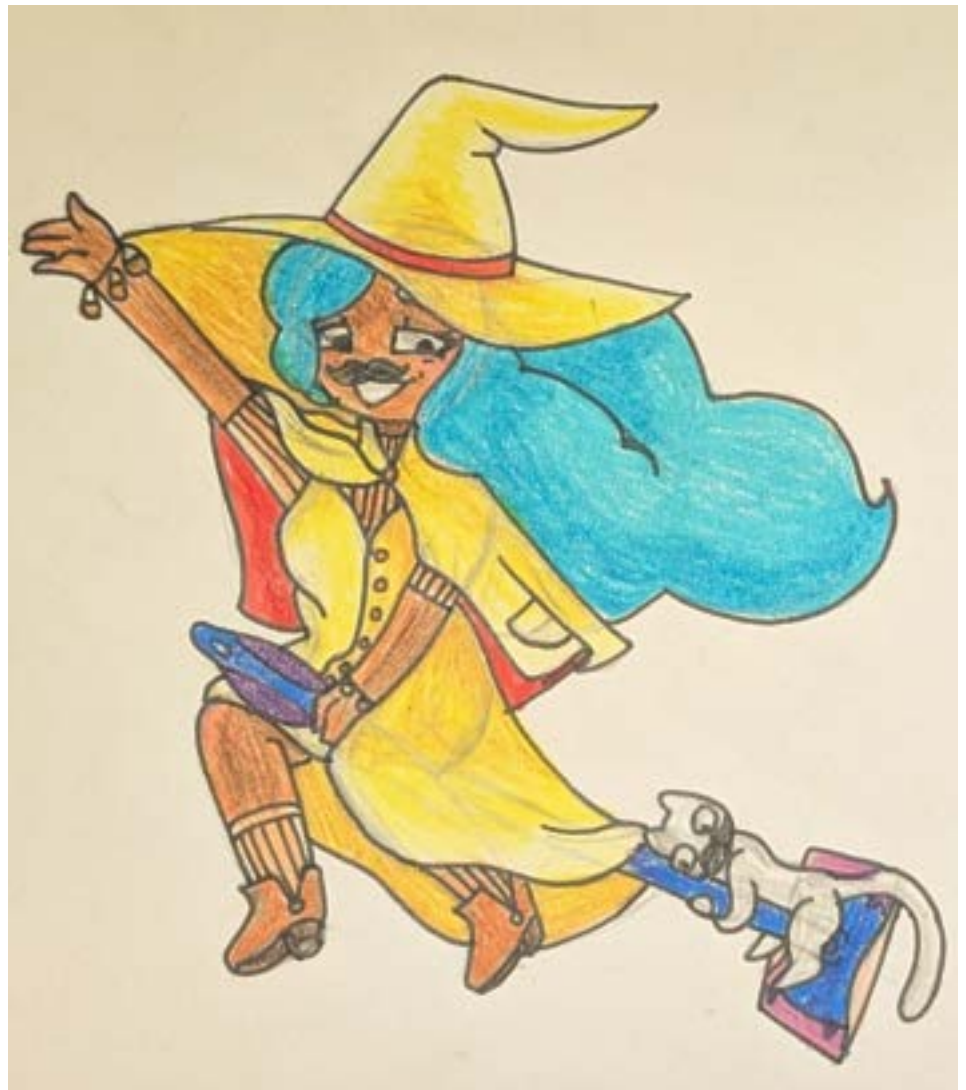
Erin Canfield, 12th grade

Walking inside they entered a huge room. They turned on the old dusty lights and a disco ball came out of nowhere. The witches placed cooked foods on a table, including their famous Witches Fingers, made from real witches, for the monsters to munch on. A creature from the house plugged in a cord and the floor lit up in squares of many colors. A goblin came running across the room to meet the skeleton to set up the DJ