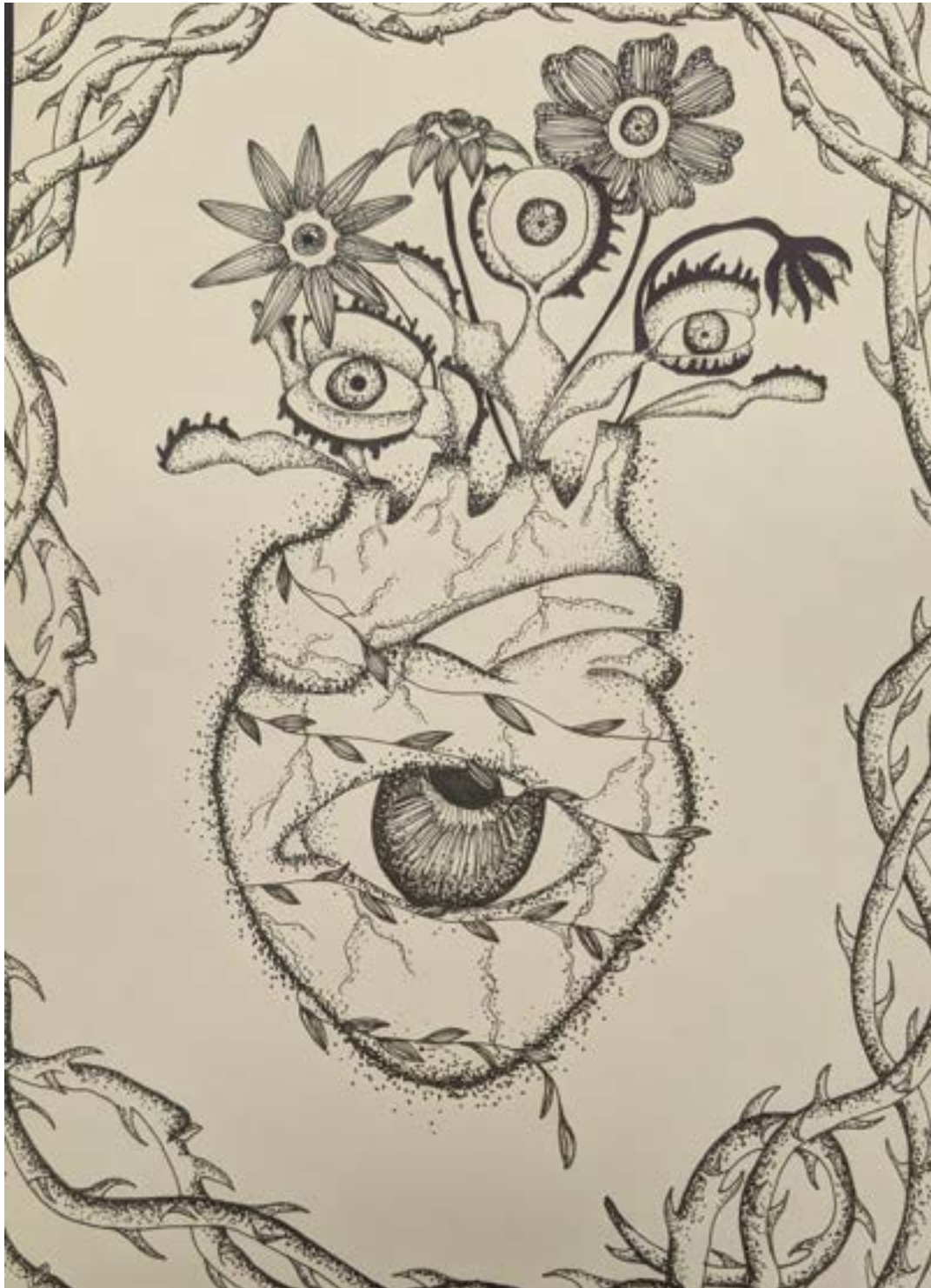
Brynna Poggemiller, 11th grade

people. Some are already dead and the ones that aren't don't look too good. We need more ambulances here now or all of these people will be dead."