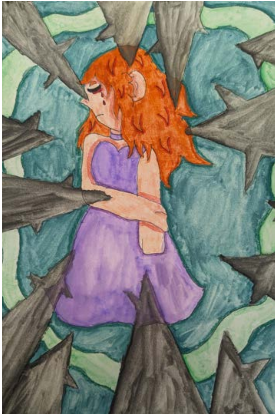
Gwen B, 11th grade

They spread out across the property. No luck. Again she hears the faint sound of whistling in the distance. This time she decides to follow it. It leads her down a path to the edge of her property.