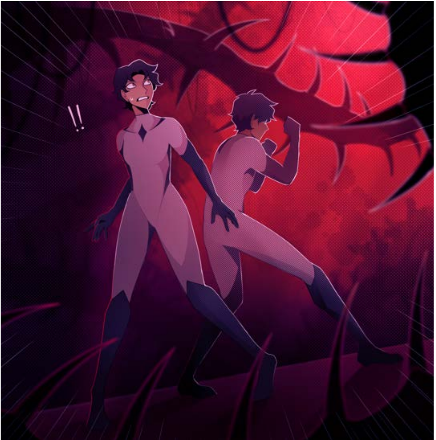
Paulina Aguilera, 10th grade

legendary treasures back to your houses," a thundering voice announced.